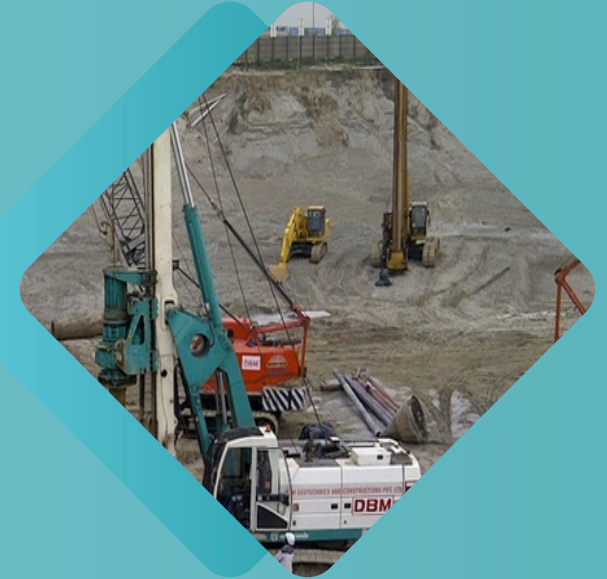
High Rise Foundations