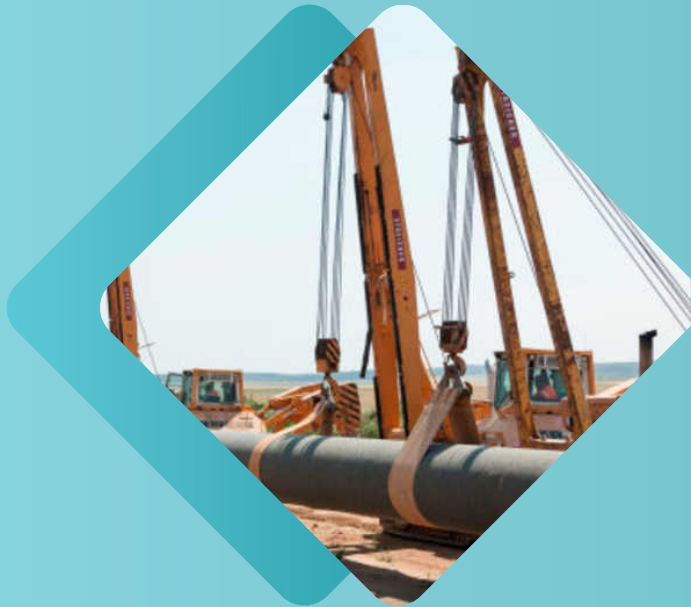
Oil & Gas Pipeline works